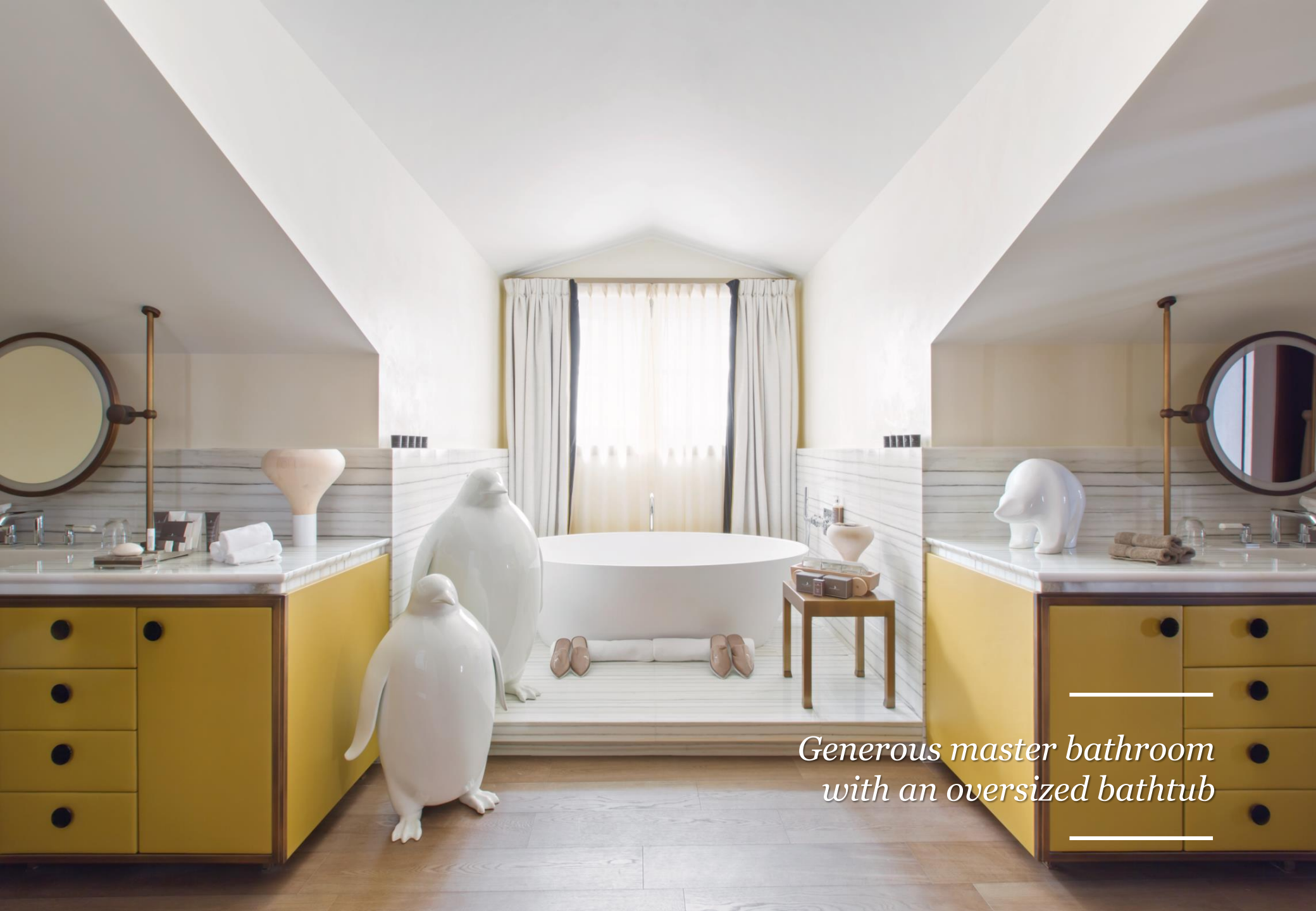
Generous master bathroom with an oversized bathtub