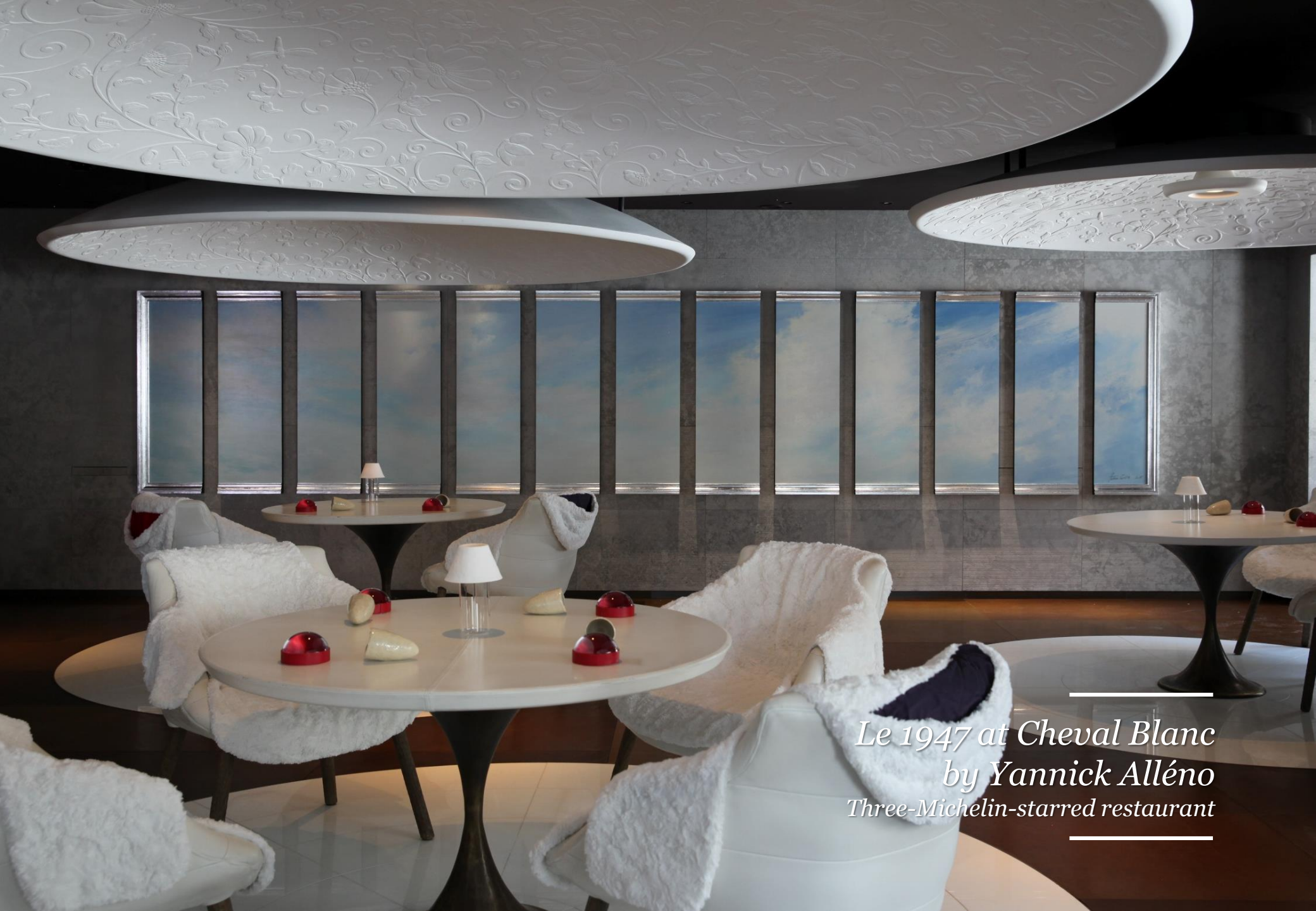
Le 1947 at Cheval Blanc by Yannick Alléno Three-Michelin-starred restaurant