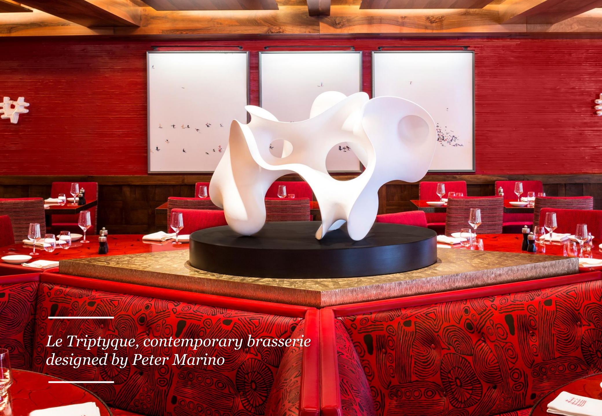
Le Triptyque, contemporary brasserie designed by Peter Marino