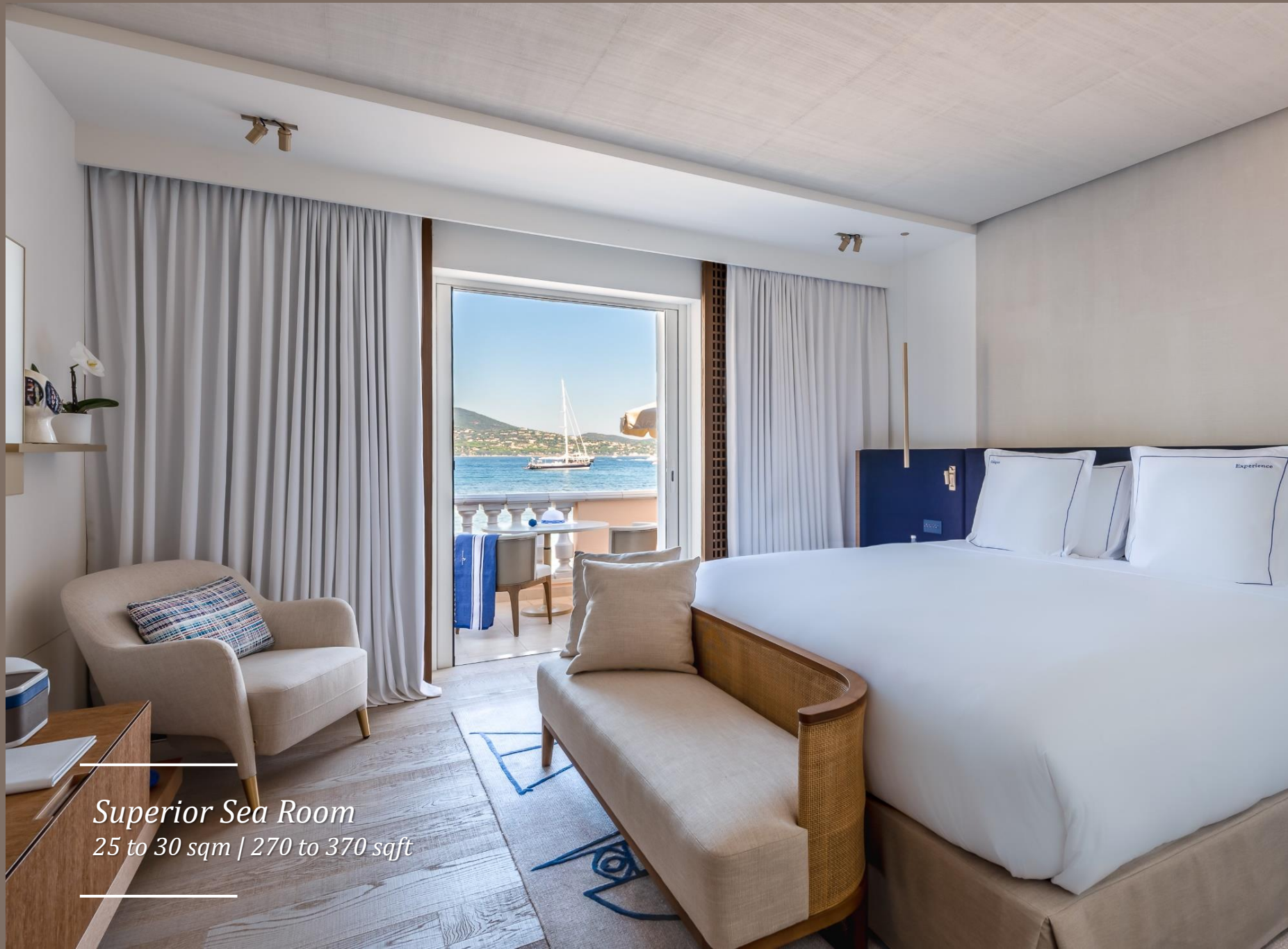
Superior Sea Room 25 to 30 sqm | 270 to 370 sqft