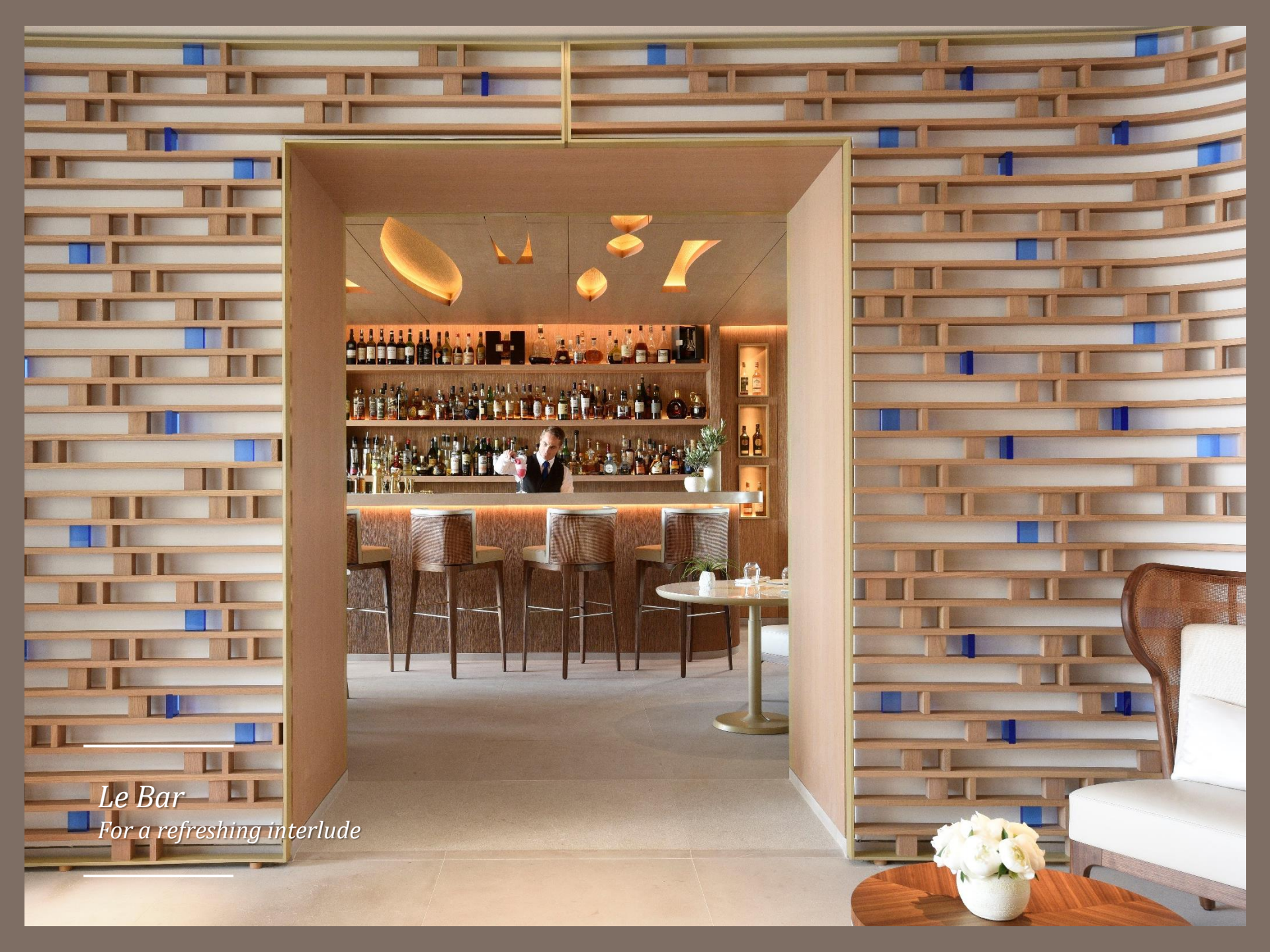
Le Bar For a refreshing interlude