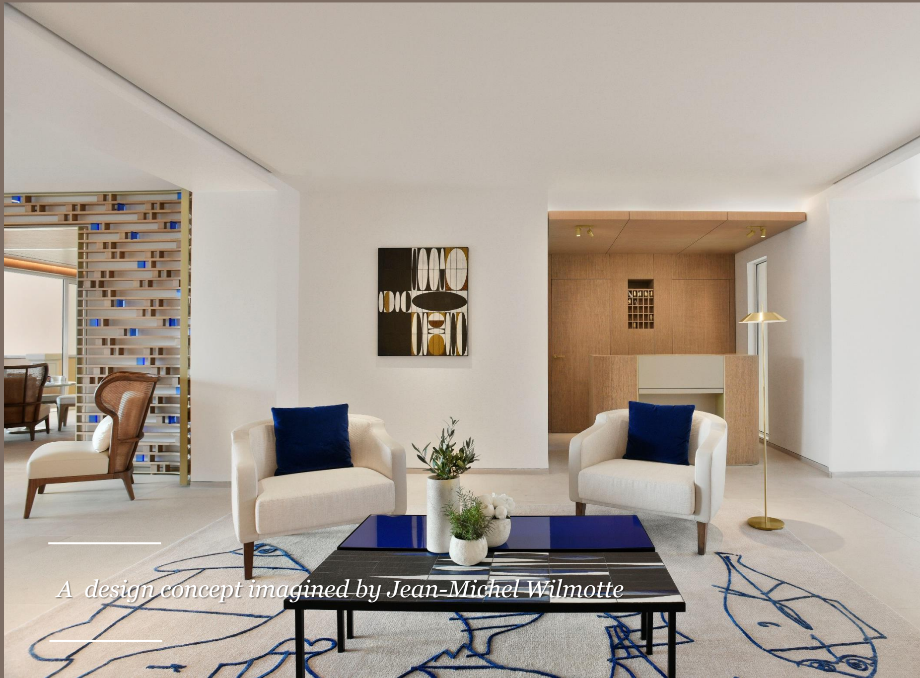
A design concept imagined by Jean-Michel Wilmotte