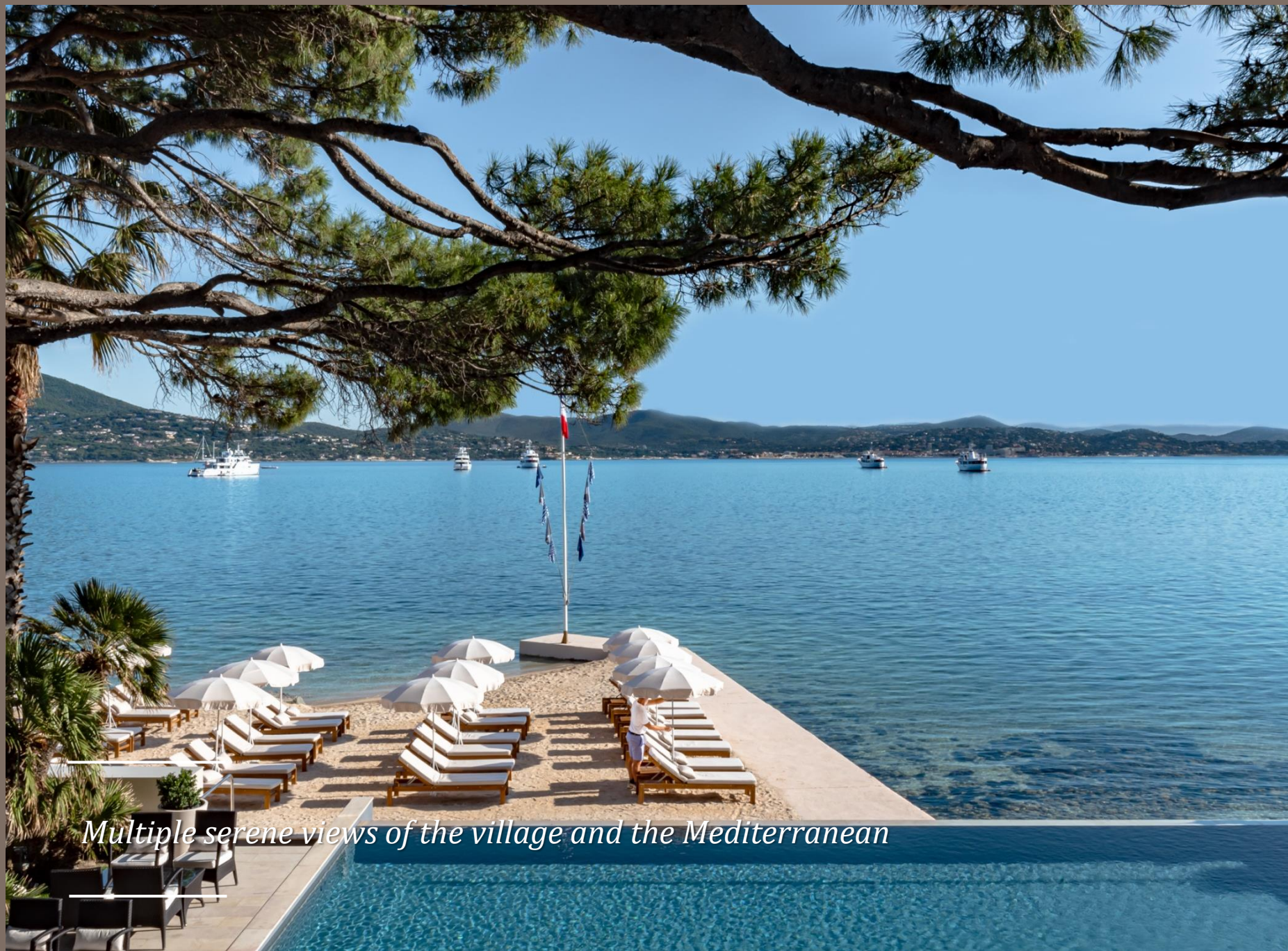
Multiple serene views of the village and the Mediterranean