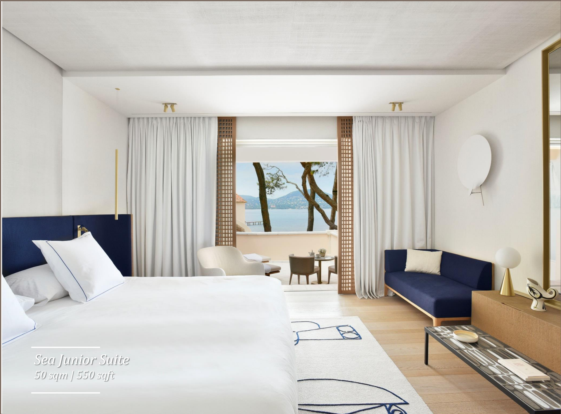
Sea Junior Suite 50 sqm | 550 sqft