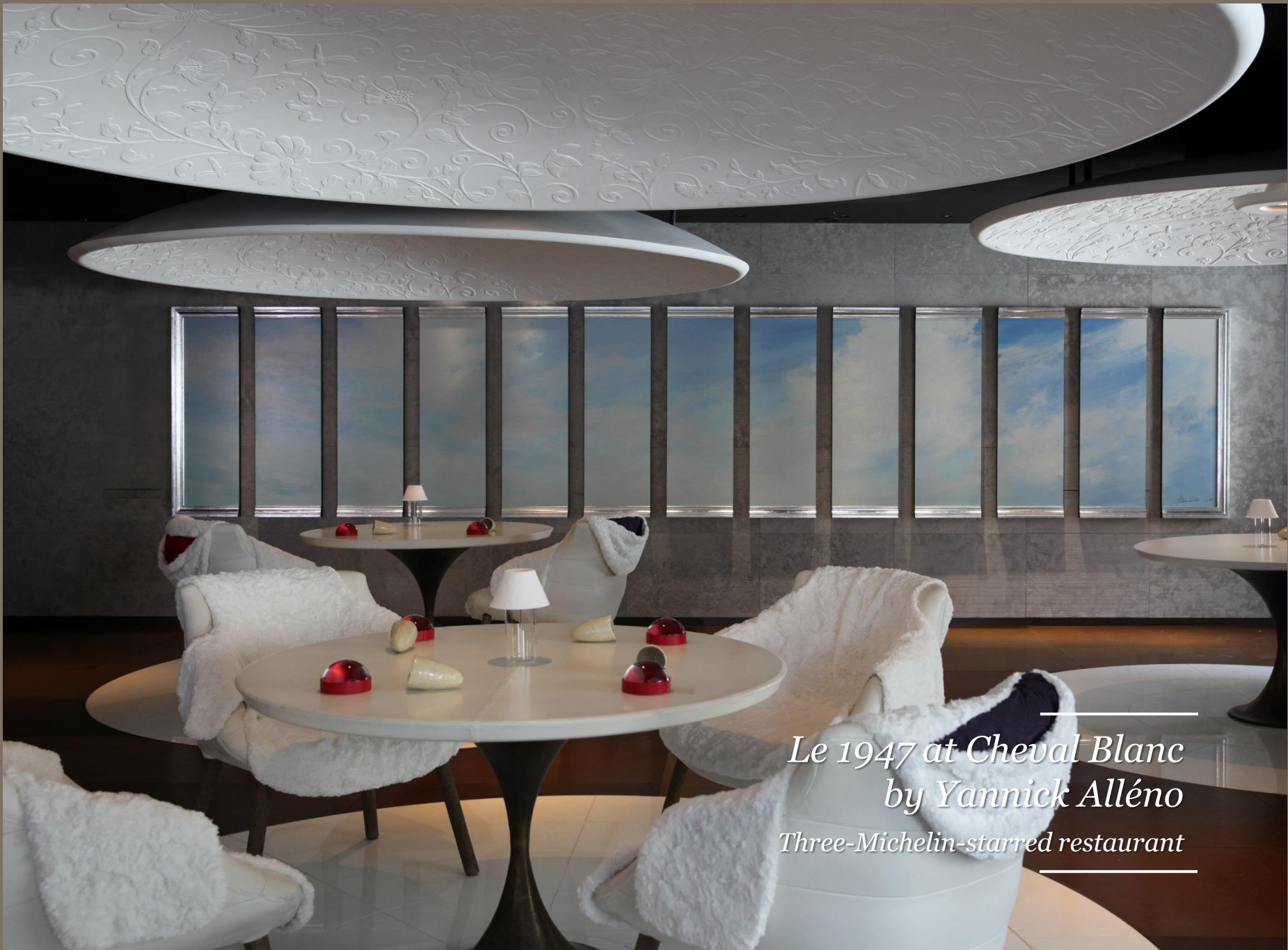
Le 1947 at Cheval Blanc by Yannick Alléno Three-Michelin-starred restaurant