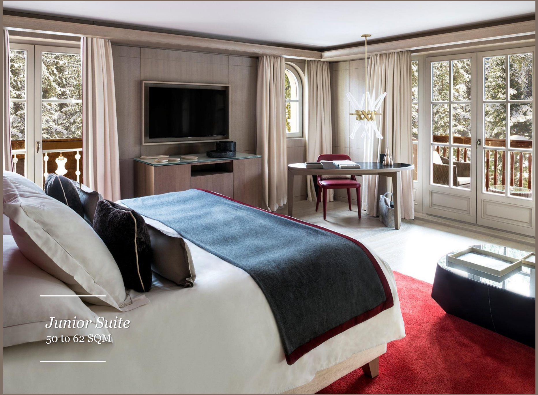
Junior Suite 50 to 62 SQM