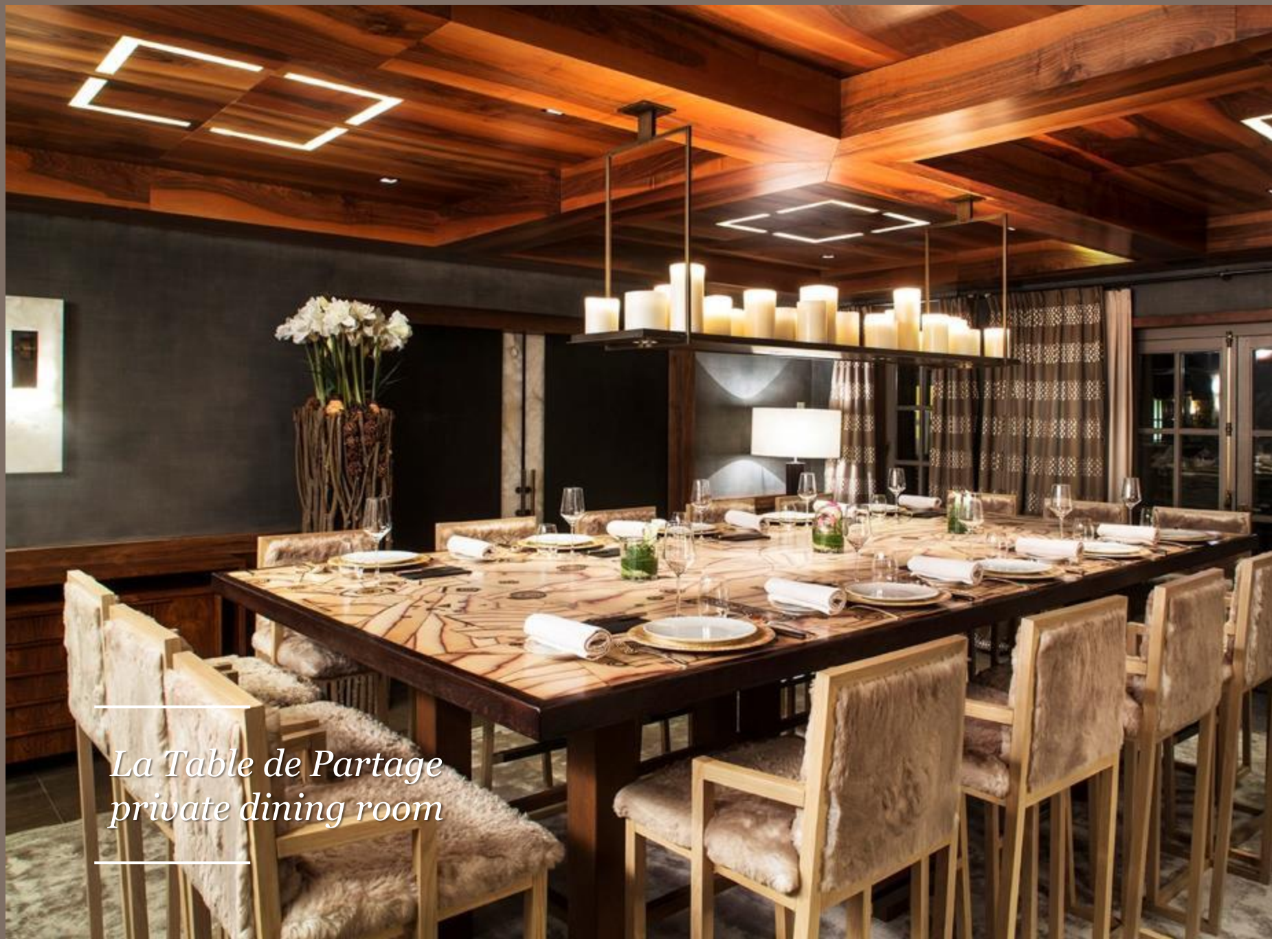
La Table de Partage private dining room