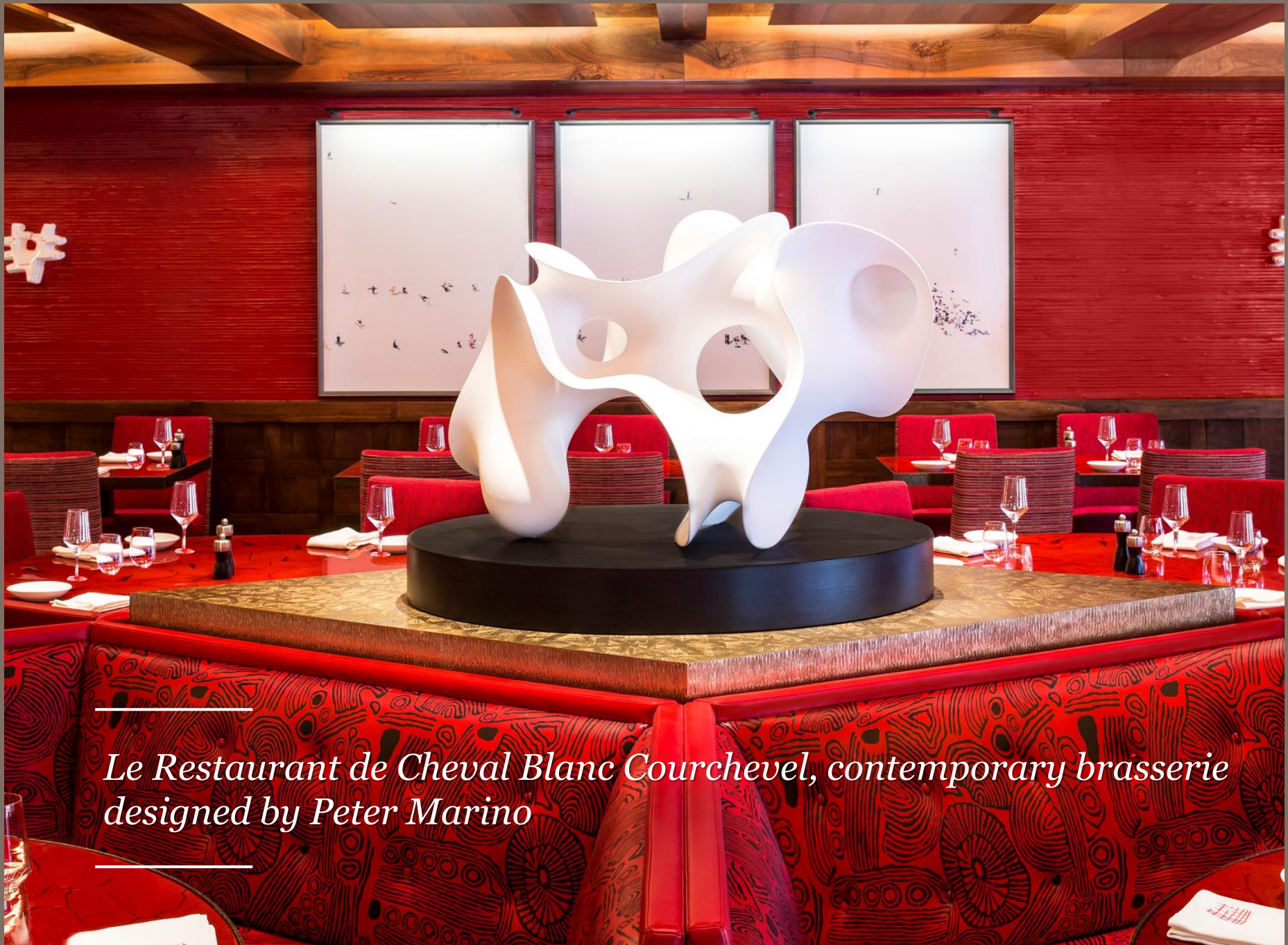
Le Restaurant de Cheval Blanc Courchevel, contemporary brasserie designed by Peter Marino