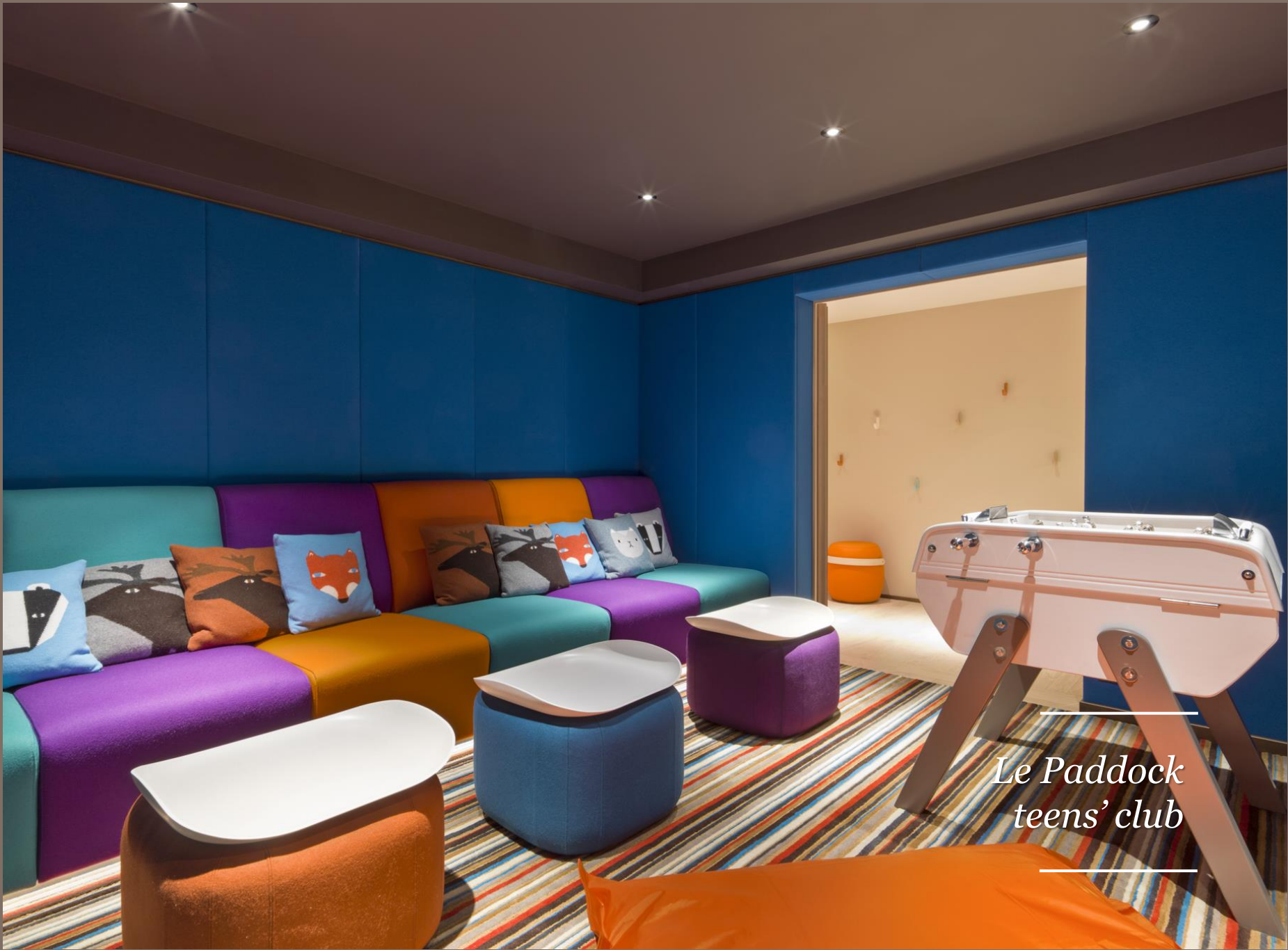
Le Paddock teens' club